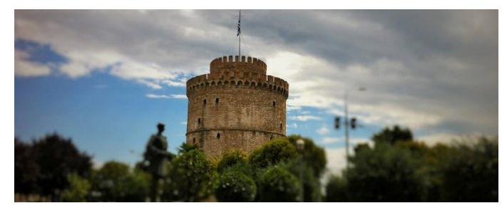
The White Tower of Thessaloniki

September 3rd, Aristotle University Campus, 546 36 Thessaloniki, Greece