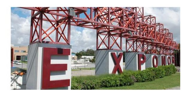
FXPONOR - Porto international Fair

(IFEVI) (Av. do Aeroporto, 772, 36318 Vigo, Pontevedra, Spain)